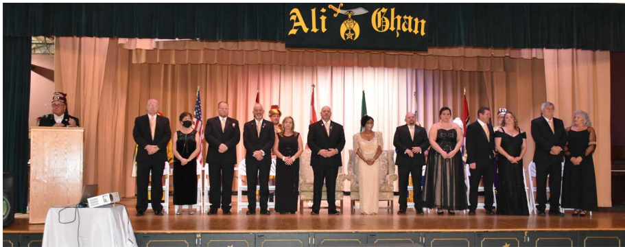
Meet the 2022 Divan Ladies