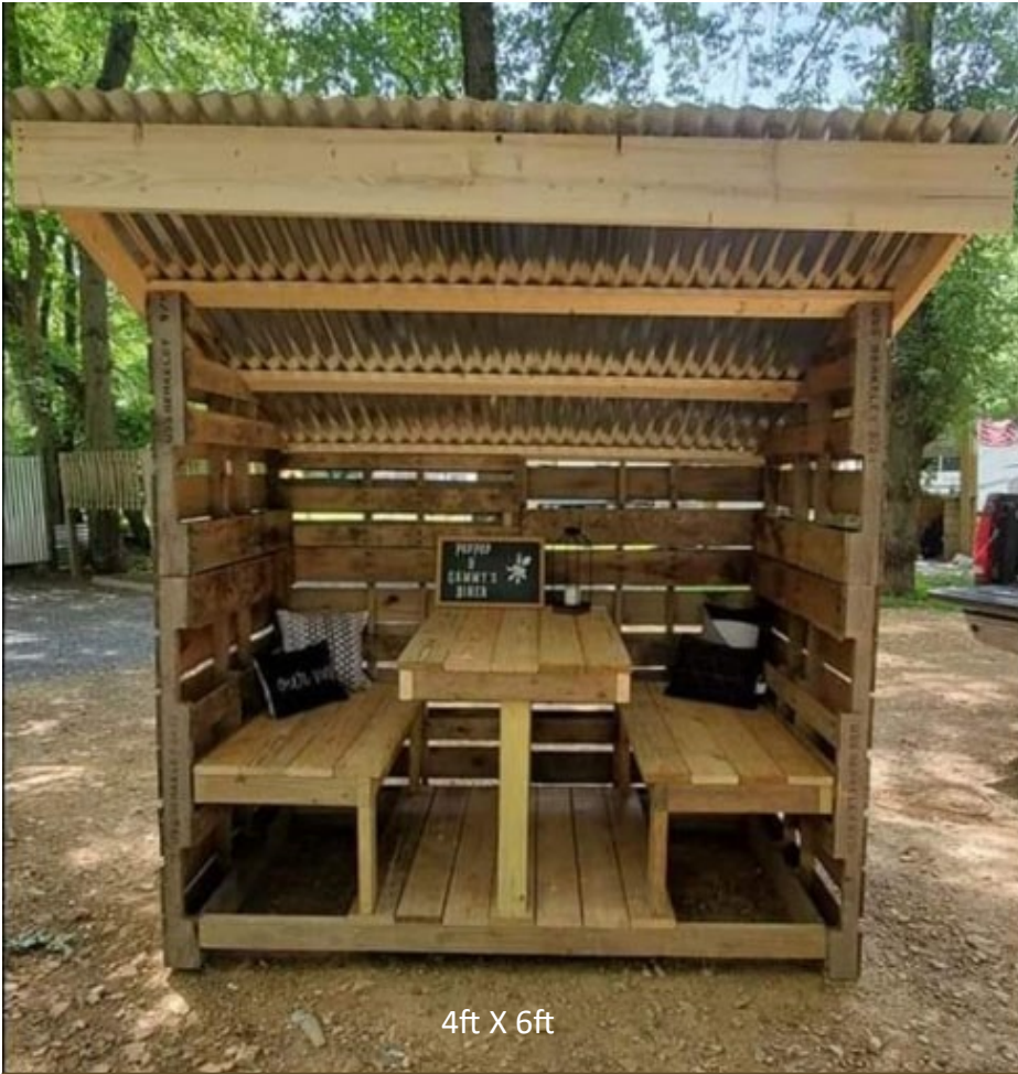
4ft X 6ft